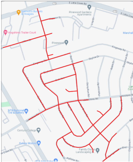
Project map, affected streets highlighted in red

The work in your neighborhood is part of the Steps to Advance Virginia's Energy (SAVE) program, our company's modernization initiative aimed at renewing our existing natural gas infrastructure. During this project, we will replace aging, older pipes with new pipes that are more durable, reduce our methane emissions and are less expensive to maintain.