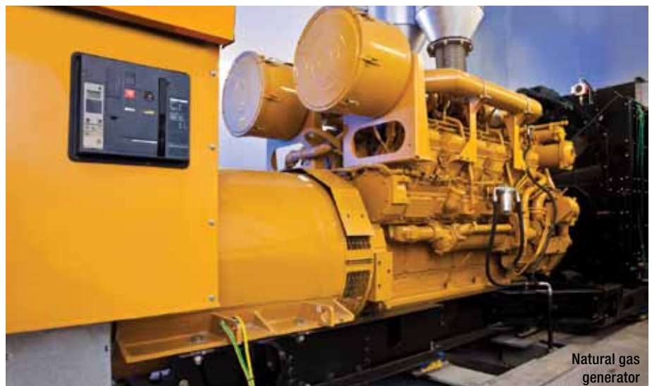
Natural gas generator

The Environmental Protection Agency (EPA) notes that natural gas fueled turbines are one of the cleanest methods of generating electricity with emissions of nitrogen from some large turbines in the single digit parts per million range. The EPA also states that, "Because of their relatively high efficiency and reliance on natural gas as the primary fuel, gas turbines emit substantially less carbon dioxide (CO 2 ) per kilowatt-hour (kWh) generated than any other fossil technology in general commercial use."