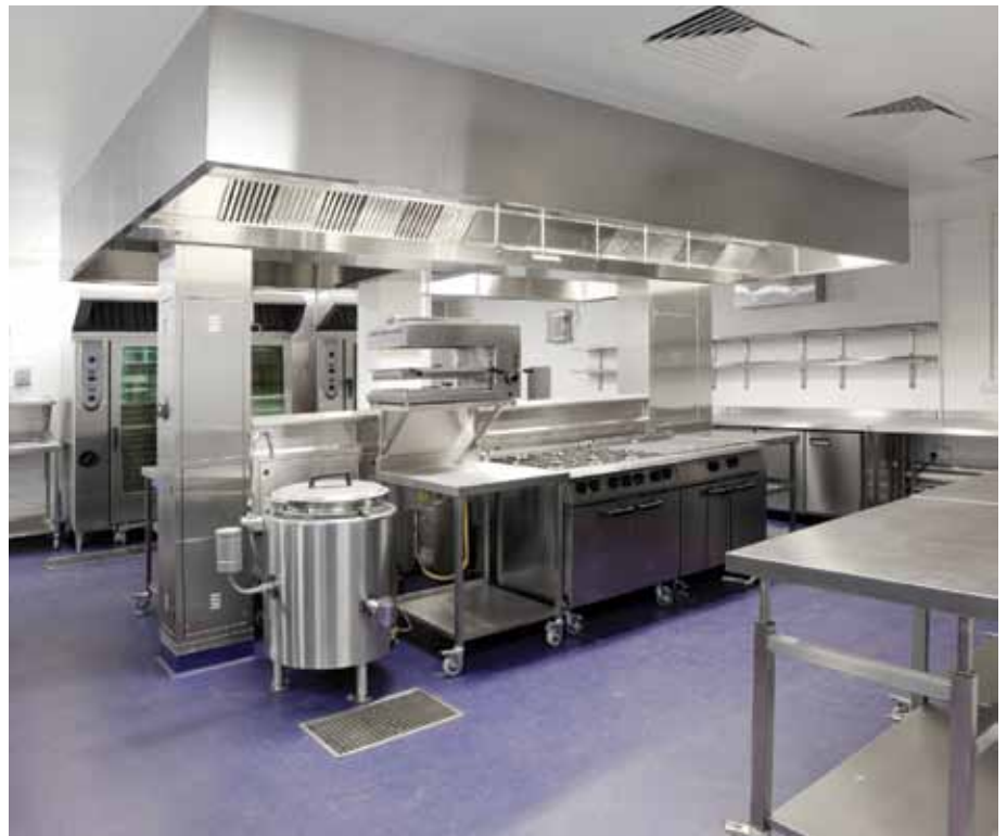
New technology is creating high-tech foodservice options that can save on operating costs and pay for themselves very quickly.

Demand control ventilation allows users to vary the speed of the hood de-