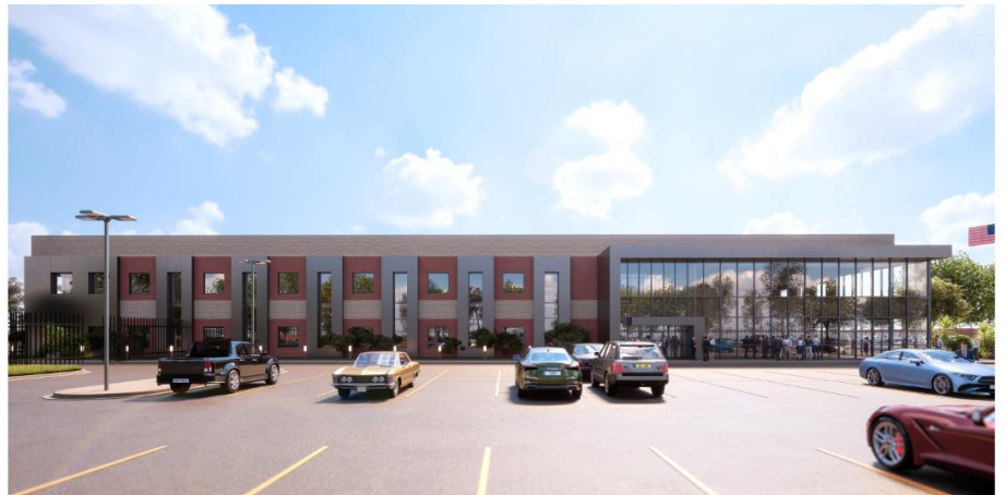
View 1 - North View