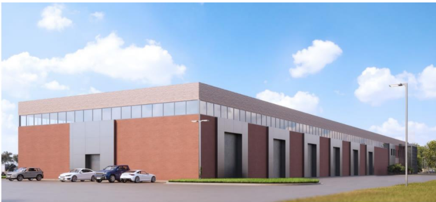
View 4 - Southeast View