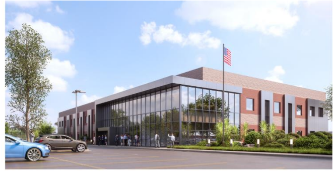
View 2 - Northwest View

Virginia Natural Gas will host an Open House on Tuesday, Oct. 24 at 7 p.m. at Greenbrier Christian Academy to share information with the public about the proposed new VNG Operations Headquarters being constructed at 401 Clearfield Avenue. The facility will serve as the new home for approximately 150 team members who are currently located in Chesapeake and Virginia Beach and will consolidate operations employees, retaining over 40 jobs and bringing an additional 100 jobs to the City of Chesapeake. The Operations Headquarters is an additional investment in the region, complementing VNG's Corporate Headquarters in Virginia Beach.